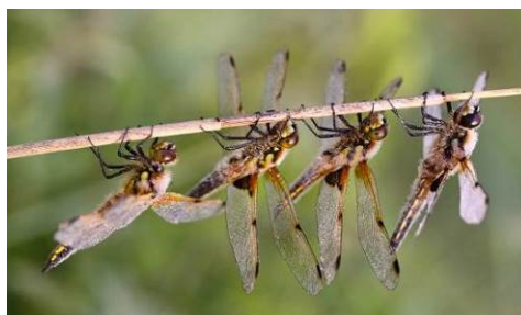
Photos: 'Emperor' dragonfly by LB Tettenborn; Four 'Four Spotted Chasers' by Lynne Newton